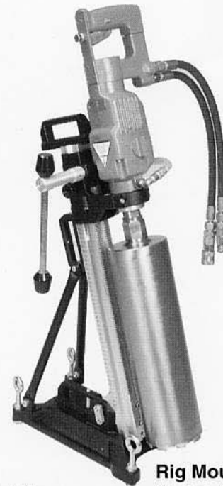
Rig Mounted Hydraulic Core Drill Drill & Anchor Stand Drill, Stand & Vacuum Model No. 2-1317-0030 SA 2-1317-0030 SV