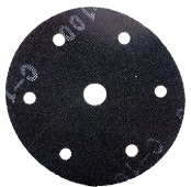
Silicon Carbide Disc (SC)

For sanding plasterboard and fine sanding