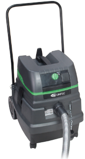
13 Gallon Capacity Wet / Dry Vacuum