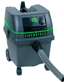
6.6 Gallon Capacity Wet / Dry Vacuum