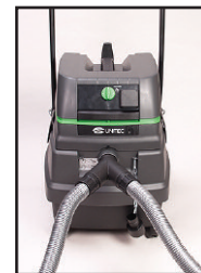
Vacuum Y-splitter available for use with two tools

Side handle mounts on right or left side