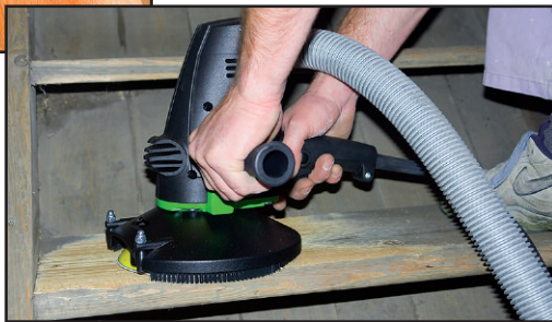
Perfect for sanding stairs and floors