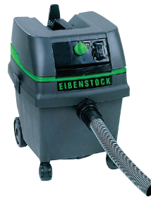
6.6 Gallon Capacity Wet / Dry Vacuum