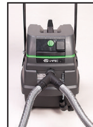
Vacuum Y-splitter available for use with two tools