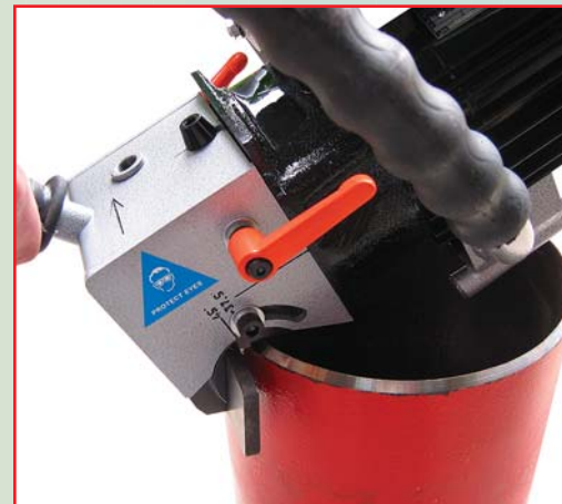
Ideal for beveling pipe 6 1/4" OD and larger.

LKS10 - Sintered carbide cutting plates (10 per pack)