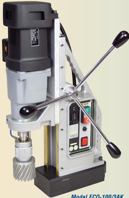
Model ECO-100/3AK with keyless chuck cutter holder