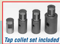
Tap collet set included

Standard equipment includes carrying case, tap collet set, safety chain, carabin hook and allen keys.