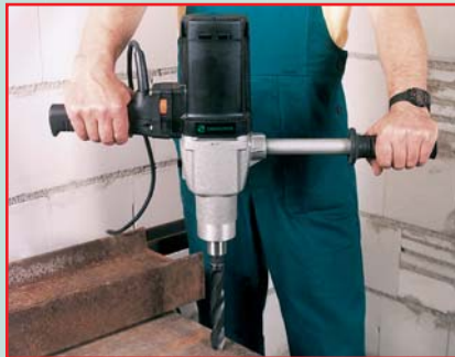
Up to 1 1/4" twist drill capacity