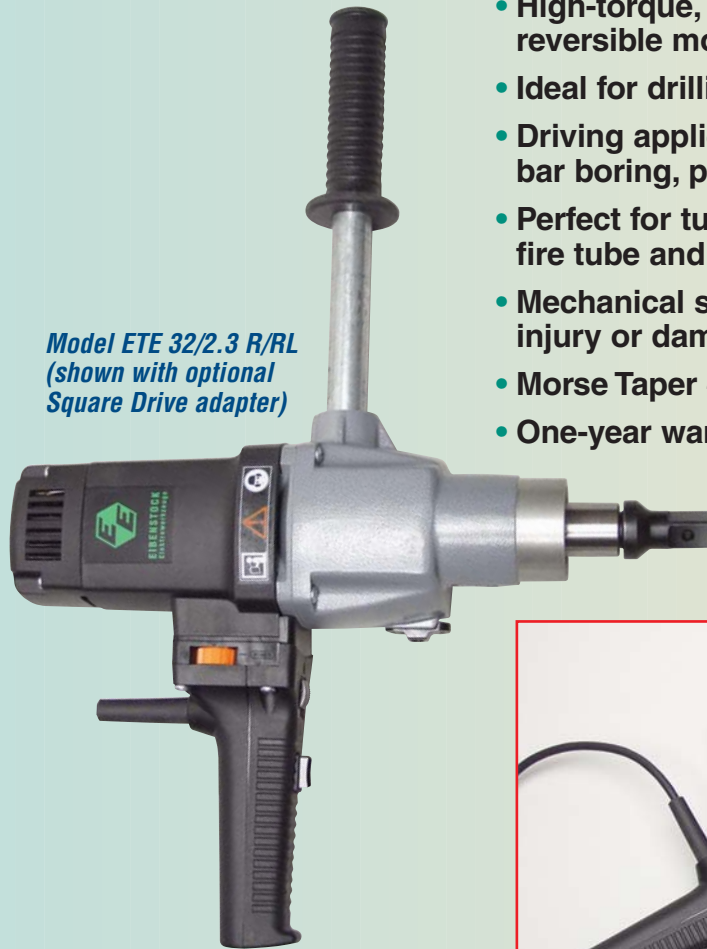
Model ETE 32/2.3 R/RL (shown with optional Square Drive adapter)