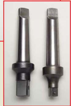
1/2" and 3/4" Square Drive accessories allow motor compatibility for various drive applications.*