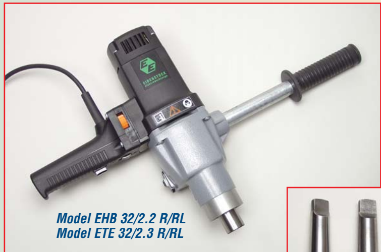
Model EHB 32/2.2 R/RL Model ETE 32/2.3 R/RL