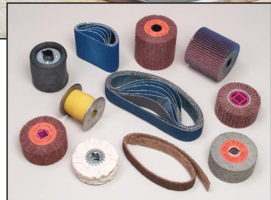
Abrasive and Polishing Accessories