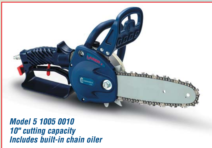
Model 5 1005 0010 10" cutting capacity Includes built-in chain oiler