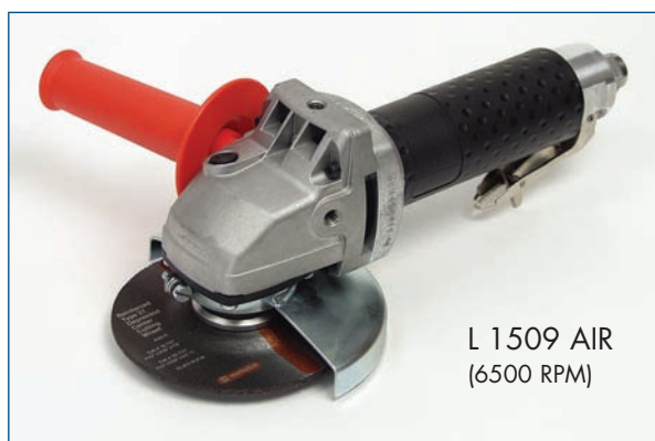
L 1509 AIR (6500 RPM)