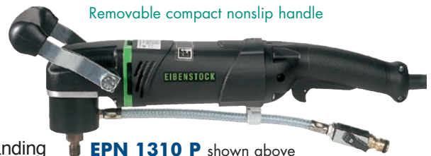
Removable compact nonslip handle