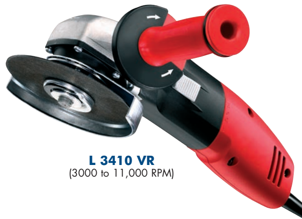
L 3410 VR (3000 to 11,000 RPM)