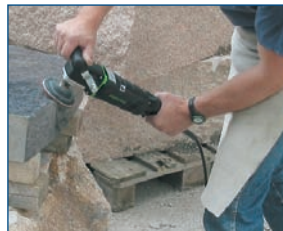
EPN 1310 P shown above