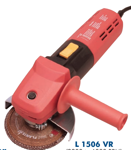
L 1506 VR (2200 to 6800 RPM)

The L 3410 VR is a small, agile grinder with a powerful 11 Amp, variable-speed motor (3000 to 11,000 RPM). A flat aluminum die-cast gear head allows the tool to reach into the tightest areas. No matter what the task and workspace, the slim, saddle-shaped motor housing and easily-accessible side switch allow this grinder to sit perfectly in your hand for comfortable operation.