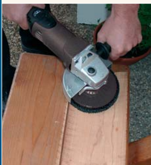
Standard hardness for rust and paint.