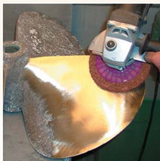
Extra-hard for stubborn dirt.