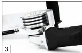
3 The drive roller with the rubber rings ensures that the grinding belts will not slip.