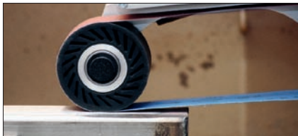
The soft grinding roller made of PUR material also allows comfortable longitudinal grinding of flat surfaces, for example to remove spot welds or eliminate deep scratches.