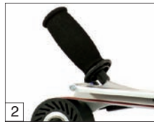
2 Additional handle for comfortable, overhead working.