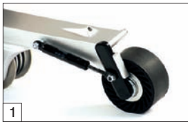
1 Gas pressure cylinder allows belt to conform to contour of pipe with proper pressure.

You can follow the external contour of the pipe diameter with light, uniform contact pressure. The new contour concept with the elastic return roller allows the grinding and polishing belts to conform around the external diameter of the pipes without great force.