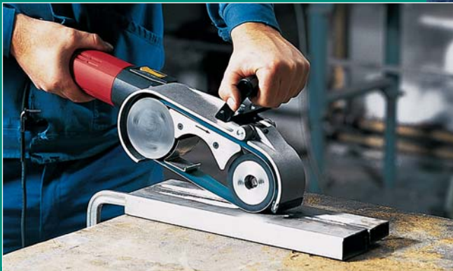
LBR 1506 with grinding belt