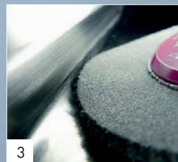
3 POLY-MAGIC-WHEEL B (900 grit)