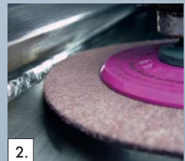
TRIMTEX® for coarse welds