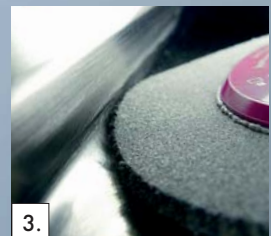
POLY-MAGIC-WHEEL A (80 grit)