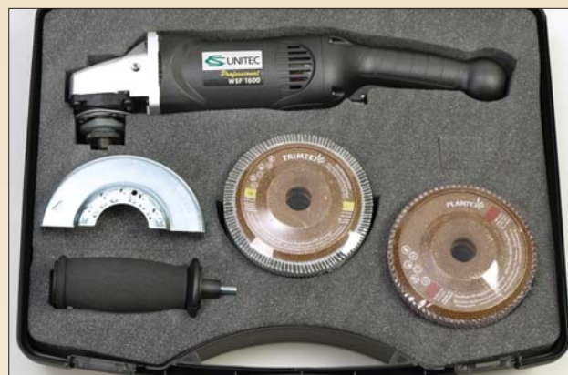
Basic Starter Kit in a case, includes: VARILEX® angle grinder, PLANTEX® discs and TRIMTEX® discs. Part Number: 80053