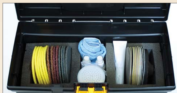
FIX Test Kit FIX Hook & Loop backing disc with PUR foam, FIX fleece discs, FIX SuperPolish discs, FIX TZ Pyramid disc, mini polishing compounds and lime powder in a practical dispenser. Part Number: 80051u

The VARILEX® is not designed for continuous use at low speed for polishing paint in the automotive trade.