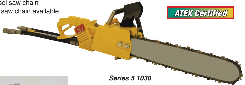
Series 5 1030