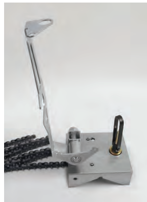
Clamp for cutting up to 27" Part No. 5 1030 9300