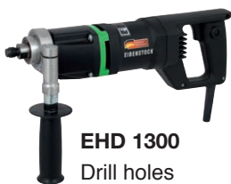
EHD 1300 Drill holes up to 3-1/4"