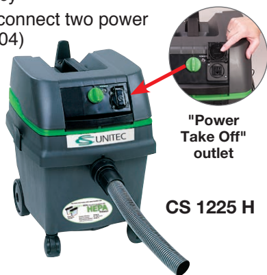
CS 1225 H