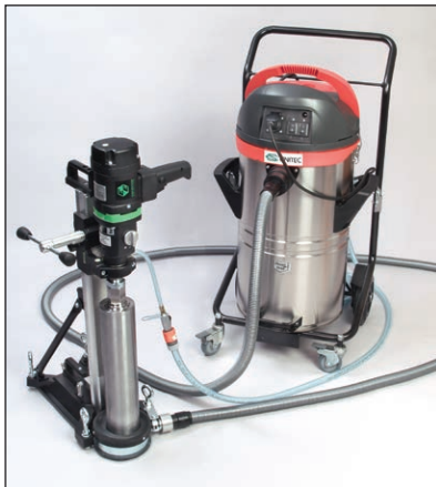
CS 2000 shown with END 130/3.1 POSV Core Drill and Water Collection Ring.