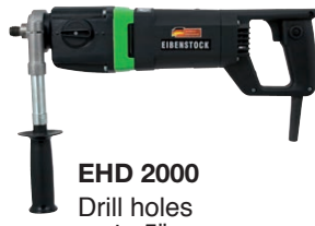
EHD 2000 Drill holes up to 5"