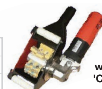
Electric Model 195.1220 2" cutting width with Rotopeen™ 'C' flaps. 4" width also available.