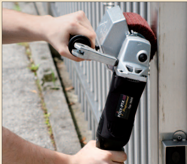
Satin finishing using interleaf fleece wheel.

A range of professional PTX Eco Smart kits is available for a variety of applications. See page 6 for more information.