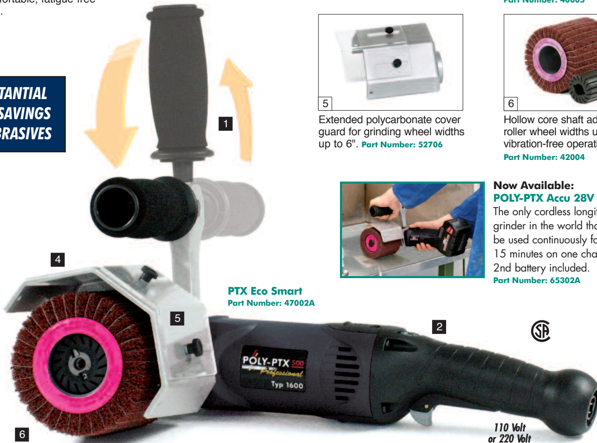
PTX Eco Smart Part Number: 47002A