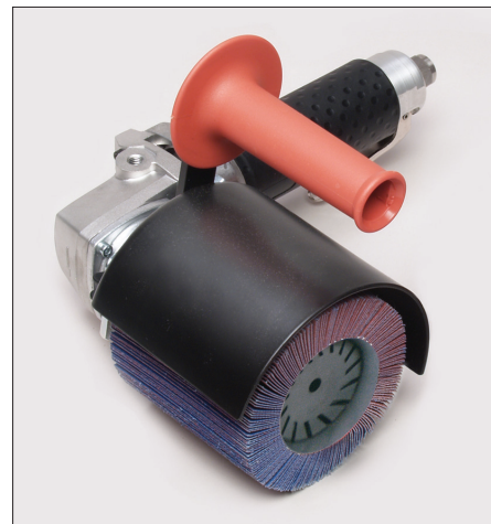
1 HP air motor at 90 PSI