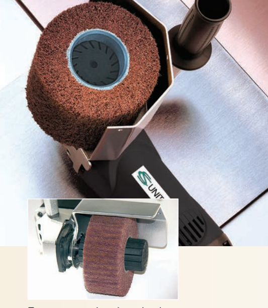
Even narrow abrasive wheels can be used on the PTX Eco Smart and positioned freely on the finned shaft (no spacer rings required).