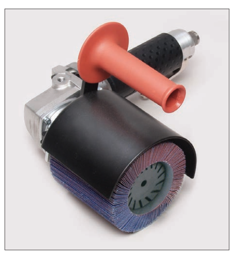
1 HP air motor at 90 PSI