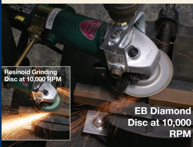
Resinoid Grinding Disc at 10,000 RPM