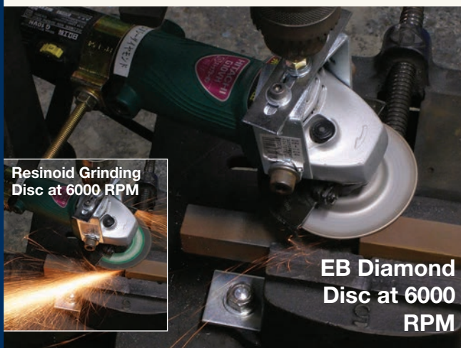
Resinoid Grinding Disc at 6000 RPM

EB diamond grinding discs reduce sparking up to 1/100 of that produced by resinoid grinding wheels (inset left).