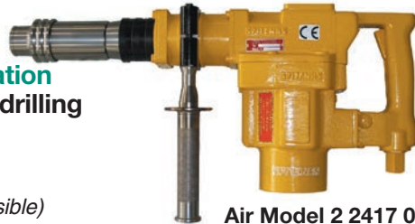
Air Model 2 2417 0010 SDS Max

Rotation Only For drilling steel and wood (not reversible)