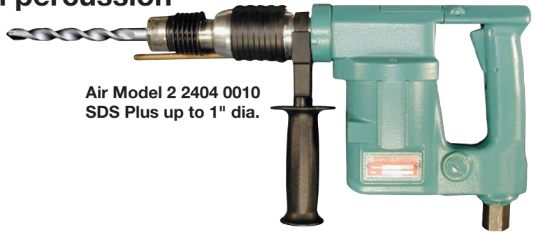
Air Model 2 2404 0010 SDS Plus up to 1" dia.