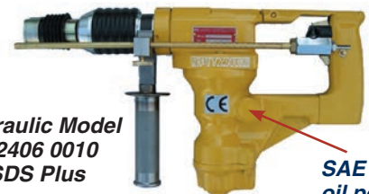
Hydraulic Model 2 2406 0010 SDS Plus

Drill concrete anchor holes, thru holes, piping and mechanical openings for construction and repair work. Switches to rotary drilling mode for steel and wood.