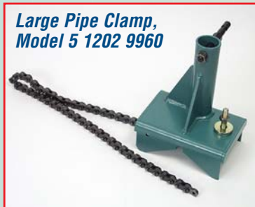
Large Pipe Clamp, Model 5 1202 9960

Ensure 90° cuts through pipe and profiles