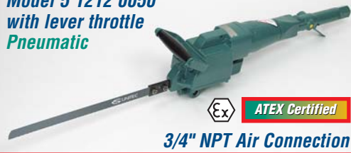
Model 5 1212 0050 with lever throttle Pneumatic