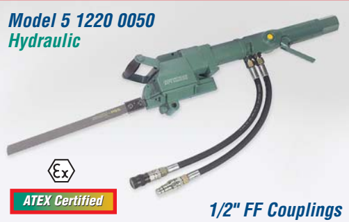
Model 5 1220 0050 Hydraulic