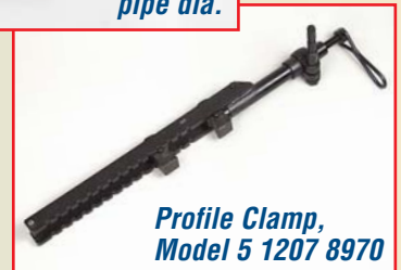
Profile Clamp, Model 5 1207 8970