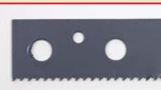
Accessory Saw Blades (see page 17)