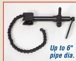
Small Pipe Clamp, Model 5 1207 9910 Up to 6" pipe dia.

Model No. 5 1207 8970 21 5 / 8 " x 11 3 / 8 " profile clamp