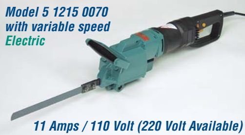
Model 5 1215 0070 with variable speed Electric