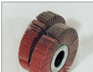
Spare flap wheels for sheet metal deburring machine BE 5 Grit 40, 60, 80, 120, 150