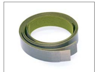
Teflon tape – self-adhesive P/N: 30340 (20" length) For extension rail to protect it from scratching the workpiece Width 3/4"; length 20" + 28"