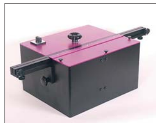
Extension rail - standard, from 20" to 28" (included)