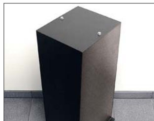
Machine stand - P/N: 30320 Strong steel machine stand with black powder coating