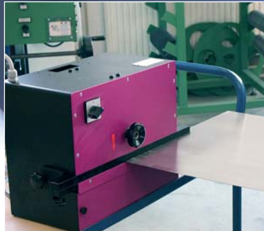
Can also be used on its side with roller tables for large thin sheets.