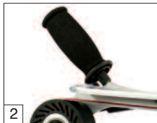
2 Additional handle for comfortable, overhead working.