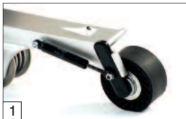
1 Gas pressure cylinder allows belt to conform to contour of pipe with proper pressure.

You can follow the external contour of the pipe diameter with light, uniform contact pressure. The new contour concept with the elastic return roller allows the grinding and polishing belts to conform around the external diameter of the pipes without great force.