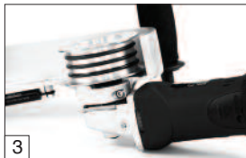
3 The drive roller with the rubber rings ensures that the grinding belts will not slip.