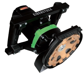
7" dia. EBS 180 H