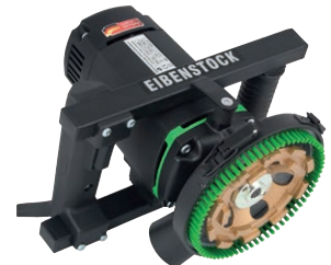
5" dia. Heavy-Duty EBS 1802.1