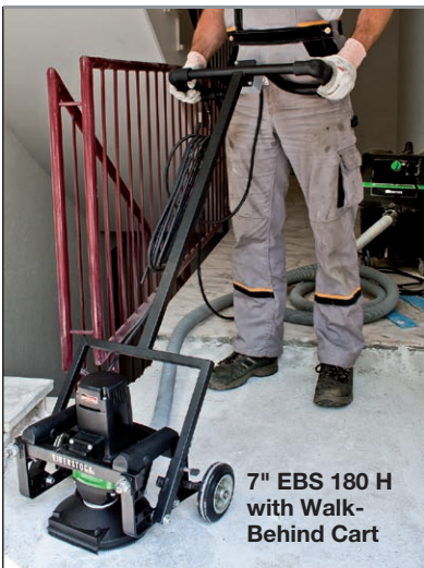
7" EBS 180 H with Walk-Behind Cart

Optional Walk-behind Carts: for EBS 125.5 D - P/N 37210 for EBS 180 H - P/N 37217