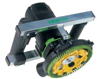
5" dia. EBS 125.5 D