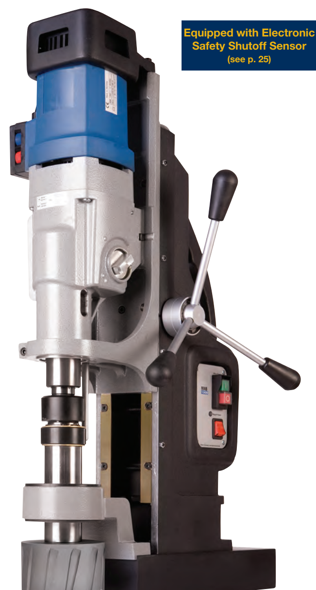
4 Gears with Variable Speed