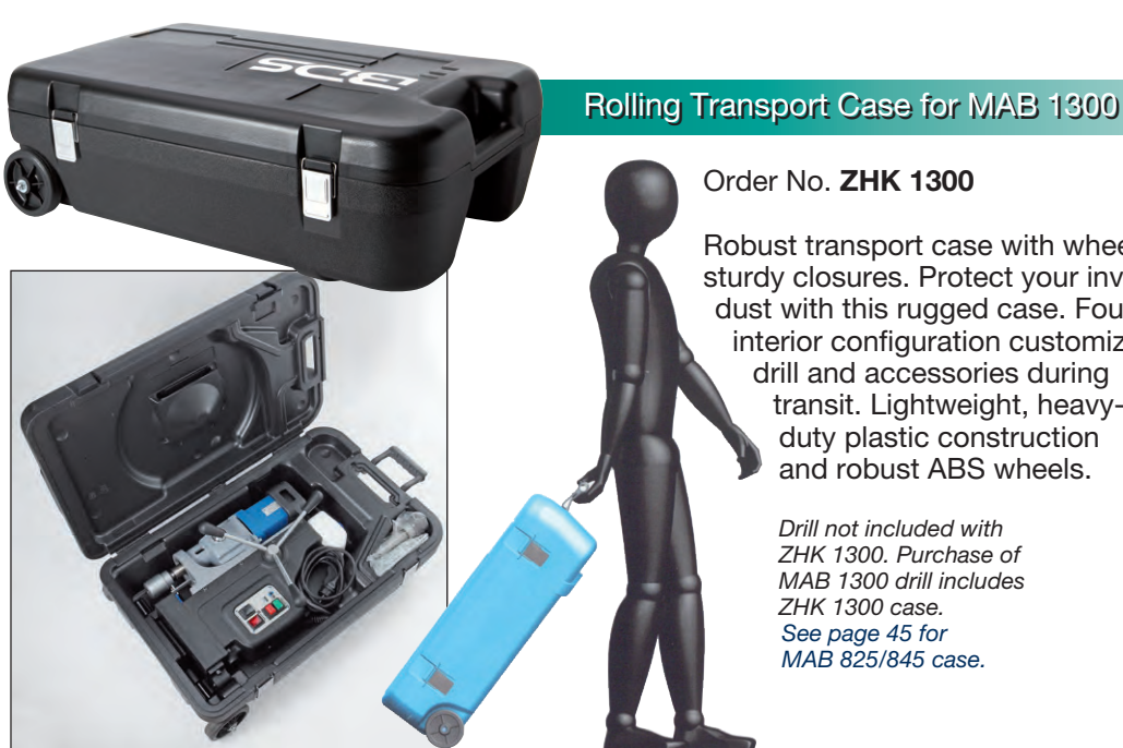
Watertight, shock-proof and robust - the right protection for your machine.

Robust transport case with wheels, carrying handle and sturdy closures. Protect your investment from water and dust with this rugged case. Four large ABS locks and an interior configuration customized for machine to secure