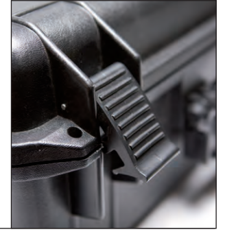
Four large ABS locks secure the robust plastic case

Drill not included with ZHK 1300. Purchase of MAB 1300 drill includes ZHK 1300 case. See page 45 for MAB 825/845 case.