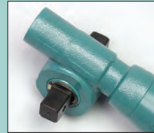
Male Sq. Drive Head 1/2" or 3/4"

Available with Male or Female Square Drives, in a variety of sizes