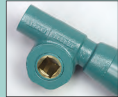
Female Sq. Drive Head 3/4" or 7/8"

Model numbers pictured above (listed from top to bottom): 6 1055 0075 (with male drive), 6 1055 0010 (female), 6 1014 0075 (with male drive)