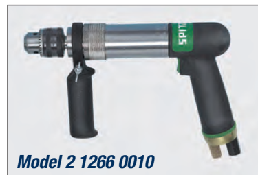
Model 2 1266 0010