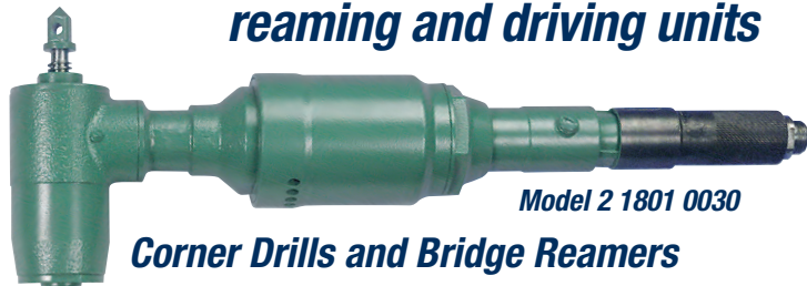
Model 2 1801 0030

Pneumatic, electric and hydraulic: high-torque drilling, reaming and driving units