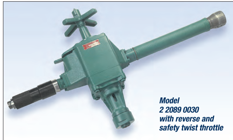
Model 2 2089 0030 with reverse and safety twist throttle