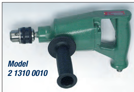
Model 2 1310 0010