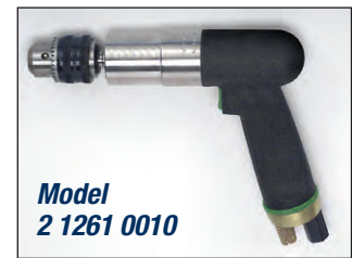
Model 2 1261 0010