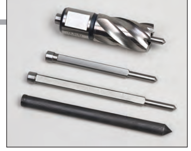
Shown at right: 2-piece pin for 3" and 4" depth cutters with 8mm pilot hole (Part No. 7-3-402).