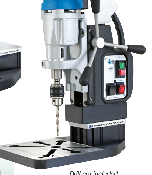
Drill not included.

ZMC 200 N includes ZMC 200 base, ZST 300 vise, (2 qty.) ZTN 100 screw and (2 qty.) ZSN 100 hexagon nut with collar