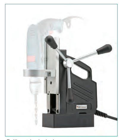
Drill not included.

For hand drills with a 1-11/16" collar diameter and 7" stroke.