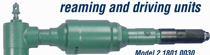
Model 2 1801 0030