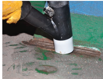
Optional Dust Collection Shroud