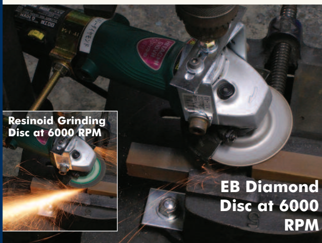
Resinoid Grinding Disc at 6000 RPM

EB diamond grinding discs reduce sparking up to 1/100 of that produced by resinoid grinding wheels (inset left).