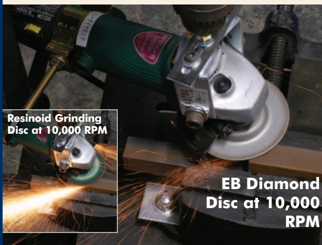
Resinoid Grinding Disc at 10,000 RPM