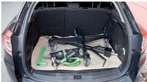
Conveniently transport to job site.