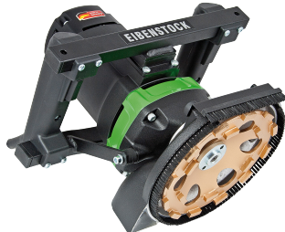
7" dia. EBS 180 H