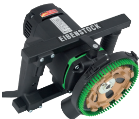
5" dia. Heavy-Duty EBS 1802.1