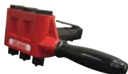
Model 199.5350 Triple head

Special price P/N 153.5300 ($608.00 list)