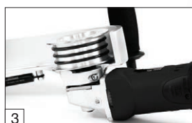
3 The drive roller with the rubber rings ensures that the grinding belts will not slip.