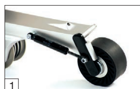
1 Gas pressure cylinder allows belt to conform to contour of pipe with proper pressure.