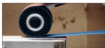
The soft grinding roller made of PUR material also allows comfortable longitudinal grinding of flat surfaces, for example to remove spot welds or eliminate deep scratches.