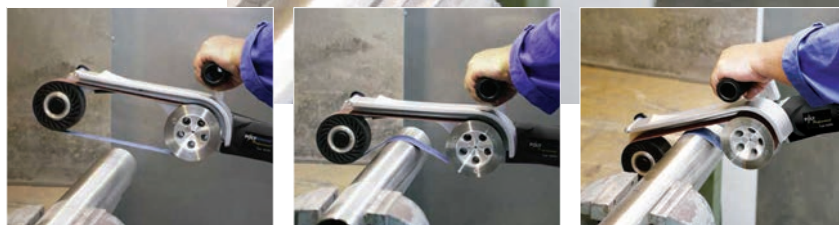
You can follow the external contour of the pipe diameter with light, uniform contact pressure. The new contour concept with the elastic return roller allows the grinding and polishing belts to conform around the external diameter of the pipes without great force.