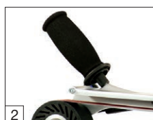
2 Additional handle for comfortable, overhead working.