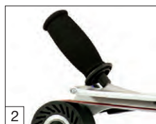
2 Additional handle for comfortable, overhead working.