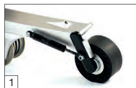
1 Gas pressure cylinder allows belt to conform to contour of pipe with proper pressure.

You can follow the external contour of the pipe diameter with light, uniform contact pressure. The new contour concept with the elastic return roller allows the grinding and polishing belts to conform around the external diameter of the pipes without great force.