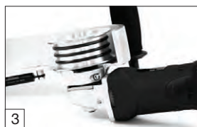
3 The drive roller with the rubber rings ensures that the grinding belts will not slip.