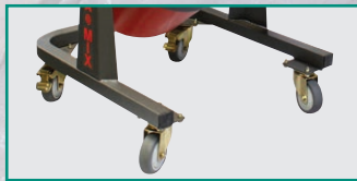
PORTAMIX PMH 80F-RL With Rimless Bucket and Removable Liner 4 Casters for Level Floor Use

Allows accurate placement – pour and spread at the same time.