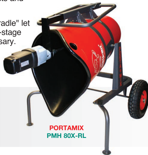
PORTAMIX PMH 80X-RL

Mix, transport and pour directly onto the floor – up to 6 bags – with one operator