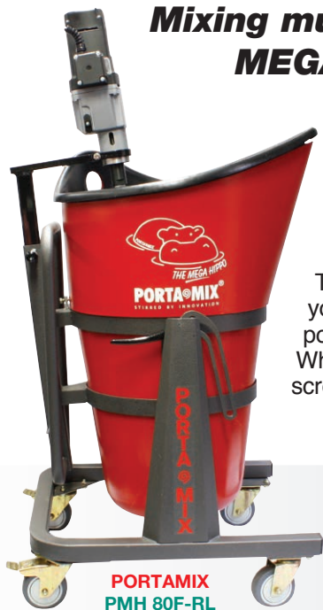
PORTAMIX PMH 80F-RL

Mixing multiple batches is faster and easier with the new MEGA HIPPO liner canister system.