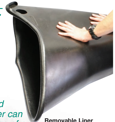
Removable Liner P/N PH 705

After mixing the first batch, the liner can be removed and cleaned. To speed up production, a second liner can be used while the first liner is being cleaned. The use of a liner also helps to prevent cross contamination and minimizes wear to the HIPPO bucket, extending its life.