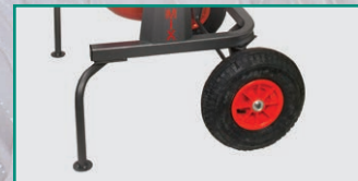
PORTAMIX PMH 80X-RL With Rimless Bucket and Removable Liner 2 Tires for Rough Terrain Use

Allows accurate placement – pour and spread at the same time.