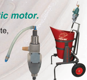
PMH 80F-AIR PMH 80X-AIR

They can be used around water with no fear of shock or blown circuitry.