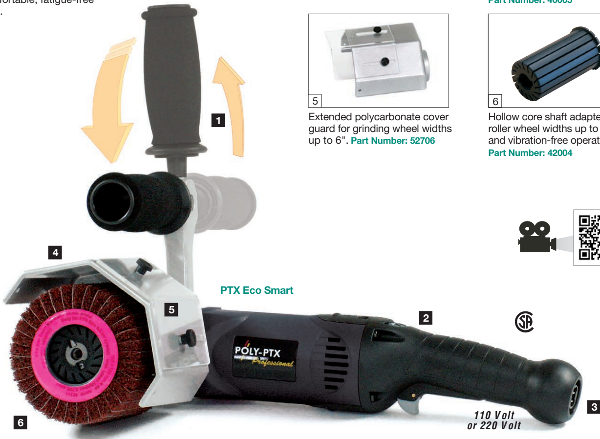
PTX Eco Smart

6 Hollow core shaft adapter for roller wheel widths up to 6" and vibration-free operation. Part Number: 42004