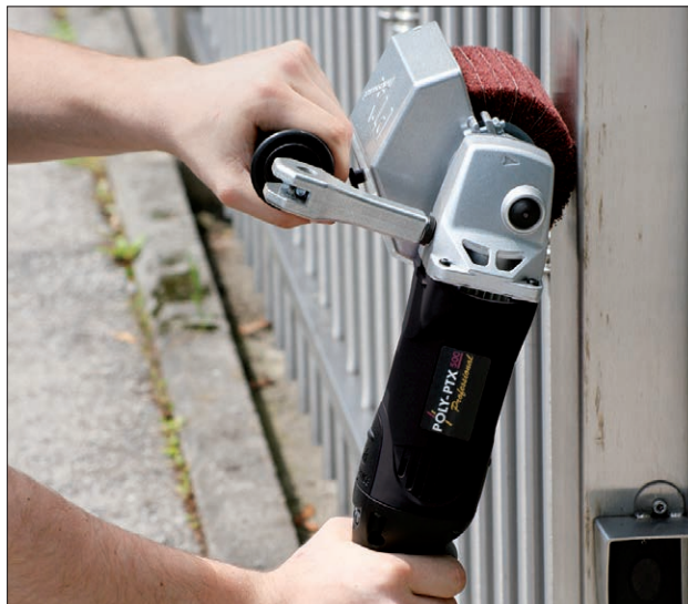
Satin finishing using interleaf fleece wheel.

CS Unitec can provide you with an extensive range of abrasive tools and accessories to cover almost every conceivable surface finishing application.