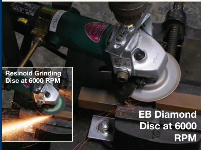
Resinoid Grinding Disc at 6000 RPM

EB diamond grinding discs reduce sparking up to 1/100 of that produced by resinoid grinding wheels (inset left).