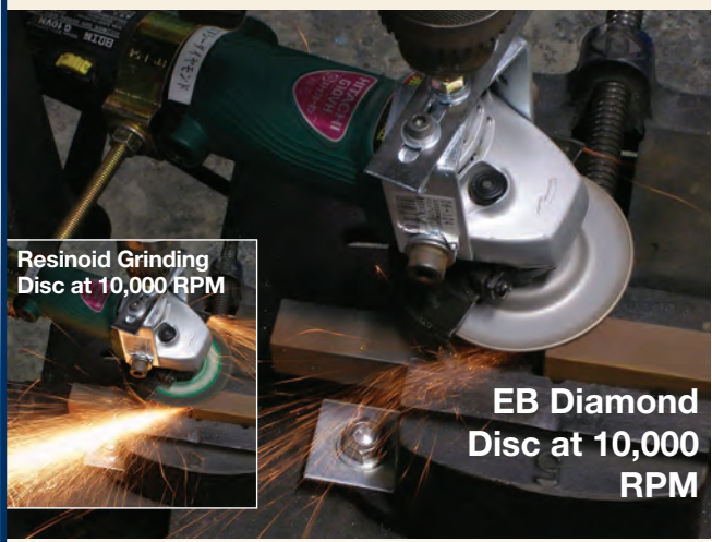
Resinoid Grinding Disc at 10,000 RPM