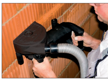
Dust collection port for use with dust extraction systems