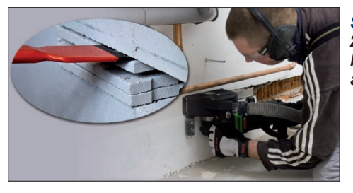
Standard Equipment: 2 premium diamond blades, carrying case and spanner wrench.