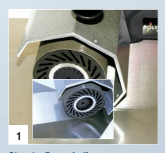
Step 1 - Pre-grinding Prepare with TZ Pyramid sleeve grit A45 (possibly A65) to remove mill skin, scratches and minor unevenness.

The newly developed grinding and polishing system, featuring special TZ Pyramid and SuperPolish fabrics from CS Unitec, produces a perfect mirror finish quickly and in just a few steps.