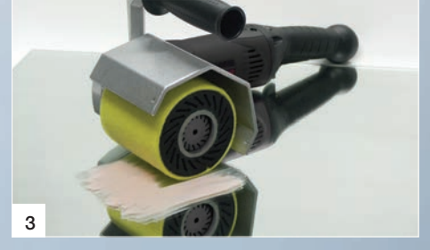
Step 3 - Mirror finish polish

Tip: After each step, remove the compound residue from the workpiece with PTX Brightex® Softclean Powder and a microfiber cloth.