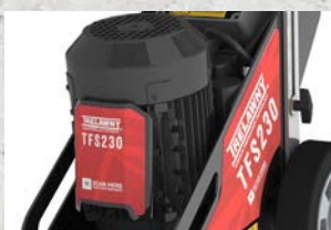
High power motor 110V or 230V