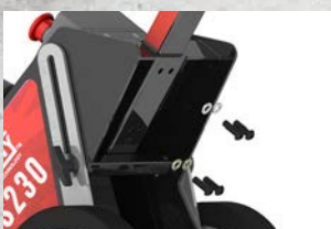
Removable handle for transportation