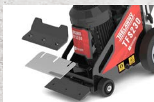
East to install blade or chisels