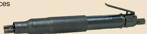
Model CSU-1BLNS Needle Scaler with Lever Throttle

Non-sparking CuBe needles (Ex308-319B) available.