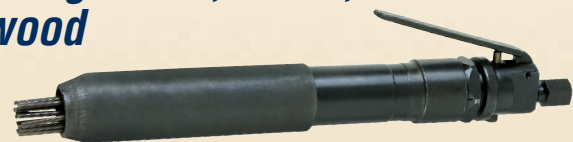
Model CSU-182LNS Needle Scaler with Lever Throttle Push throttle hammers also available.

Non-sparking CuBe needles (Ex308-319B) available.